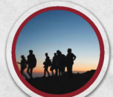
And Many Other Speakers Please see website for full schedule