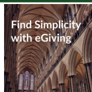
Find Simplicity with eGiving