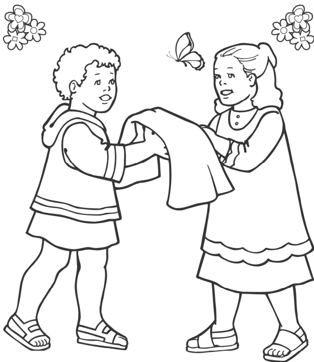
There was no needy person among them. Acts 4 : 34