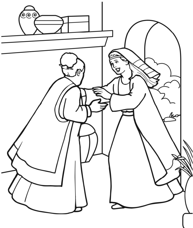
[Mary] entered the house of Zechariah and greeted Elizabeth.