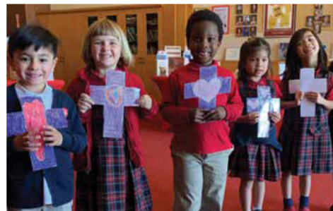
A Saint Theresa Student: Young person of faith | Active, creative learner Well-rounded individual

In These Chaotic Times, Lord, Teach Us to Pray